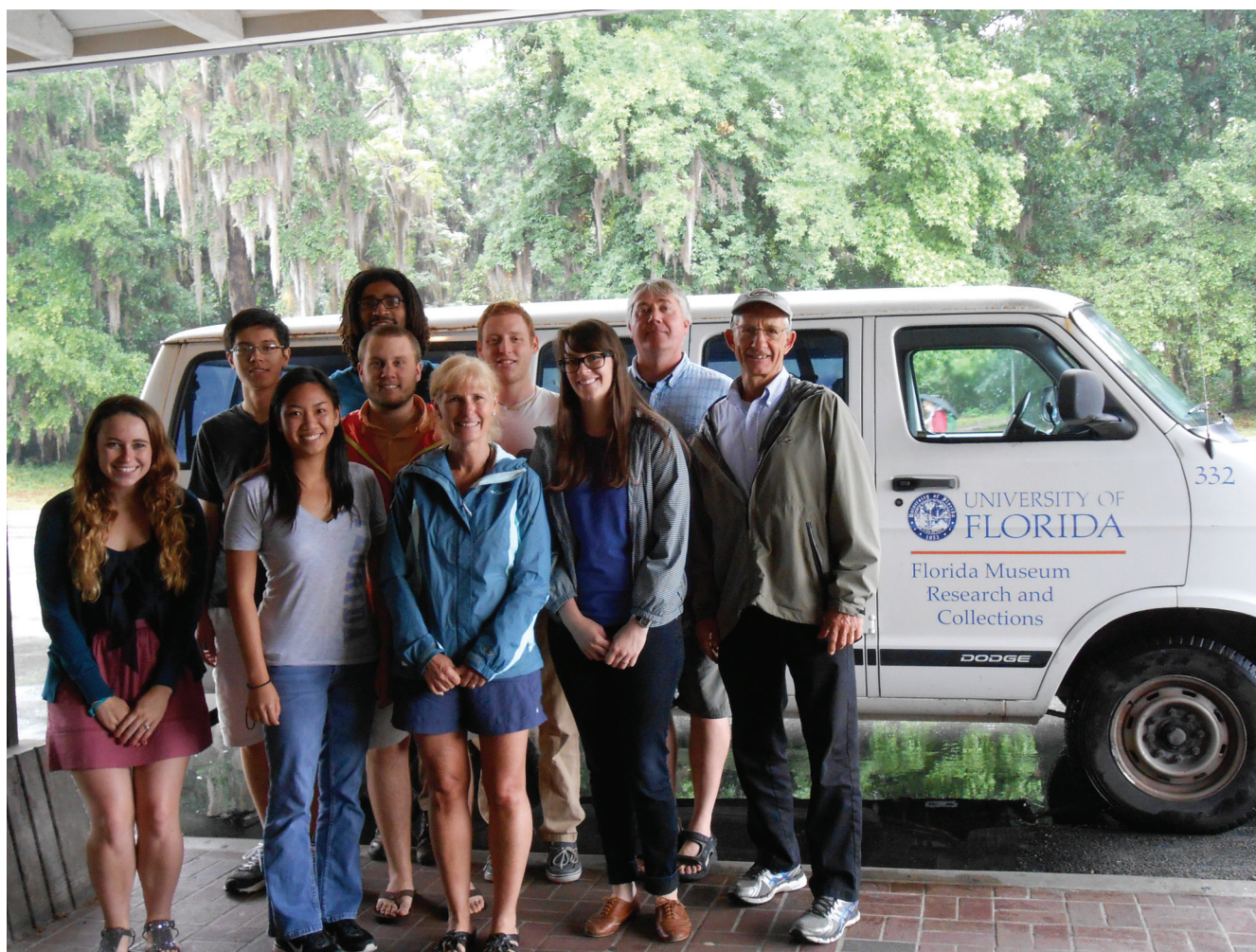
Figure 3. University of Florida undergraduate biology students on a museum field trip to collect plant specimens at the Ordway-Swisher Biological Station.

data. If they desire to do so, instructors can enhance the comparative component of the exercise by having different student groups focus on different plant species or conceptual issues. By coordinating with other instructors to conduct this exercise simultaneously at multiple institutions, students from different programs can interact online to enhance learning, foster interactions, and develop a collective and more collaborative perspective on scientific problem solving.