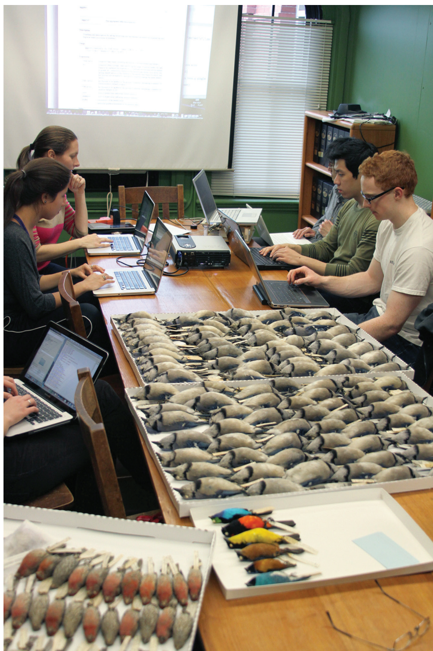
Figure 1. Undergraduate students at Harvard use specimens and associated data to explore speciation and molecular evolution in spring 2013.