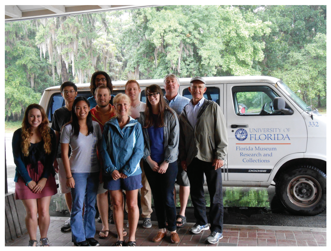
Figure 3. University of Florida undergraduate biology students on a museum field trip to collect plant specimens at the Ordway-Swisher Biological Station.

data. If they desire to do so, instructors can enhance the comparative component of the exercise by having different student groups focus on different plant species or conceptual issues. By coordinating with other instructors to conduct this exercise simultaneously at multiple institutions, students from different programs can interact online to enhance learning, foster interactions, and develop a collective and more collaborative perspective on scientific problem solving.