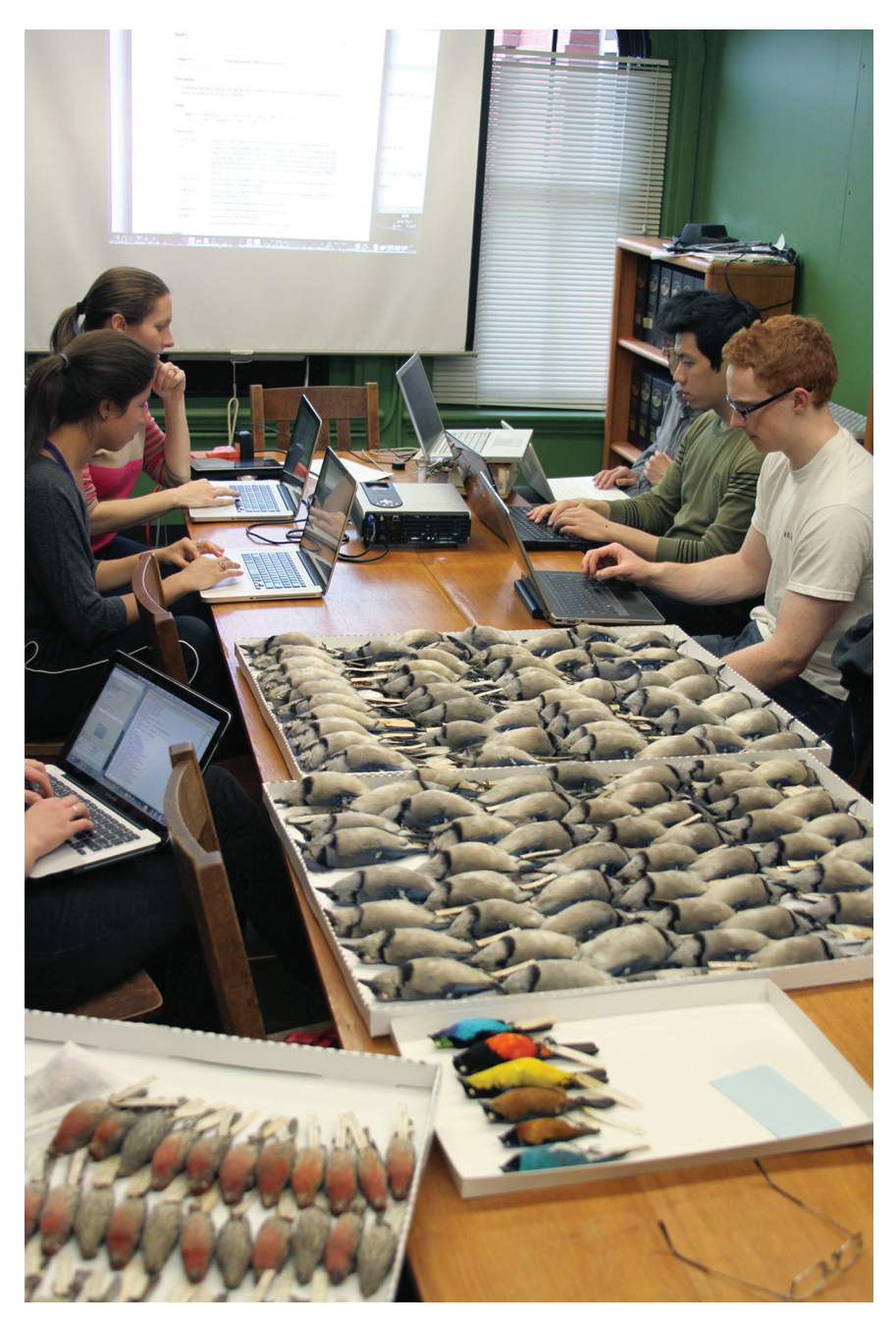
Figure 1. Undergraduate students at Harvard use specimens and associated data to explore speciation and molecular evolution in spring 2013.